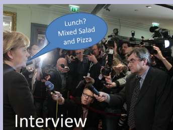
Examples for LEK teaching materials (PowerPoint slides)